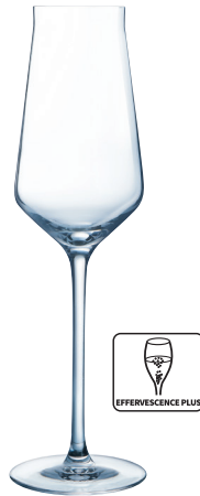
REVEAL'UP 21 cl - 7½ oz Ø M = 70 mm H = 233 mm W = 153 g J8907 4 x 6 pack