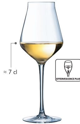
REVEAL'UP SOFT 30 cl - 10½ oz Ø M = 83 mm H = 217 mm W = 140 g J8908 4 x 6 pack