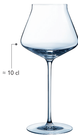
REVEAL'UP INTENSE 45 cl - 15¾ oz Ø M = 104 mm H = 221 mm W = 189 g J8742 4 x 6 pack