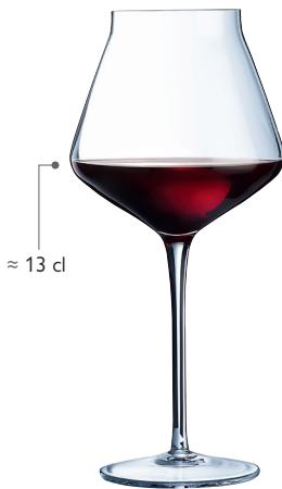
REVEAL'UP INTENSE 55 cl - 19¼ oz Ø M = 111 mm H = 234 mm W = 200 g J9014 4 x 6 pack