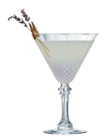
WEST LOOP Martini 27 cl - 9½ oz Ø M = 113 mm H = 168 mm W = 230 g Q4027 2 x 6 pack