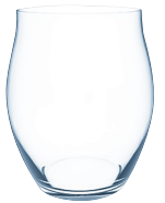
40 cl - 14 oz Ø M = 87 mm H = 103 mm W = 138 g N0834 4 x 6 pack