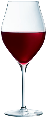
47 cl - 16½ oz Ø M = 91 mm H = 227 mm W = 185 g V6190 2 x 6 pack