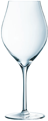
55 cl - 19¼ oz Ø M = 96 mm H = 239 mm W = 195 g V6189 2 x 6 pack