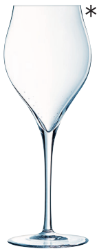
30 cl - 10½ oz Flute Ø M = 78 mm H = 211 mm W = 150 g Q1151 4 x 6 pack