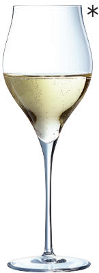
35 cl - 12¼ oz Flute Ø M = 82 mm H = 235 mm W = 155 g Q0818 4 x 6 pack