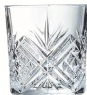
Old Fashioned / Rocks 30cl – 10 1/4oz X0471 24 pack