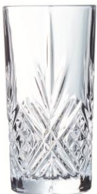
Beverage Hiball 38cl – 13 1/2oz X0470 24 pack

Super strong cut crystal style tumblers, the must have for longevity and style.