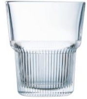
Old Fashioned / Rocks 27cl – 9 1/2oz V9573 4 x 6pk (24s)