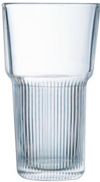
Cooler Hiball 65cl – 22 3/4oz X0434 2 x 6pk (12s)