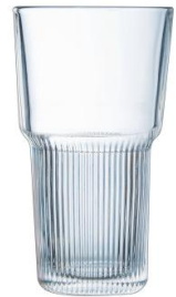
Tubo 31cl – 11oz V9571 4 x 6pk (24s)