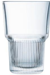
Beverage Hiball 35cl – 12 1/4oz V9572 4 x 6pk (24s)