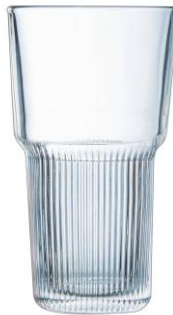
Cooler Hiball 46cl – 16 1/4oz X0433 2 x 6pk (12s)