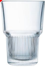
Beverage Hiball 42cl – 14 3/4oz V9574 4 x 6pk (24s)